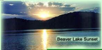
Beaver Lake Sunset