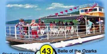
Belle of the Ozarks

Beaver Lake 500 miles of shoreline & 30,000 acres of crystal clear water!