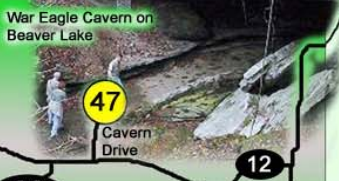
War Eagle Cavern on Beaver Lake